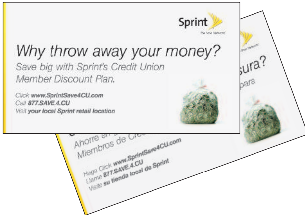
Item: 740, 740S Indoor Banner Size: 36" x 20" (quantities limited based on availability)