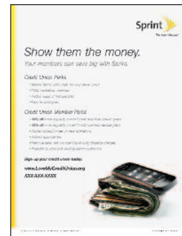
Item: Publication Ad Art (e-mail/cd)