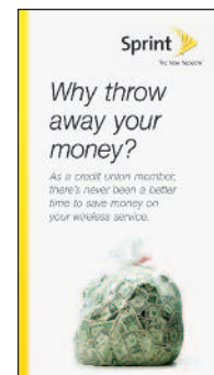
Item: Insert Mail House Statement Inserts Size: 3 1/2" x 6 1/2"

Order Today FAX your order to: 734.793.1540 or call: 800.262.6285 ext. 333