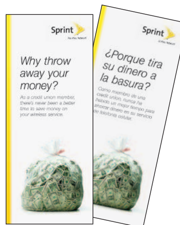
Item: 400, 400S Lobby Display Take Ones Size: 3 1/2" x 8 1/2" Packaged in 200s