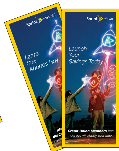
Item: 740, 740S Indoor Banner Size: 36" x 20" (quantities limited based on availability)